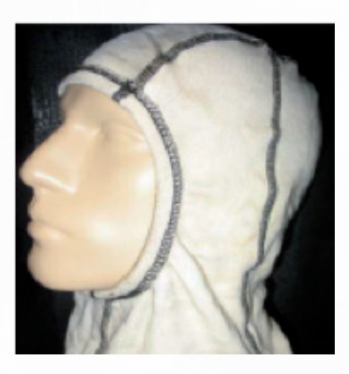
Hood inside out – this side with DuPont™ Nomex® Nano Flex