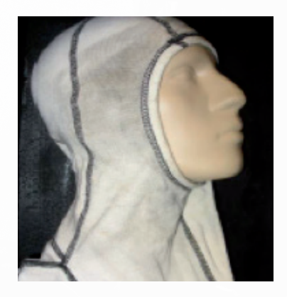
Hood inside out with traditional layers

Nomex® Nano Flex is a specialty nonwoven made of submicron continuous fibers which provides a superior protective barrier. Heat and flame protection is inherent to the Nomex® fiber - it can't be washed away or worn down.