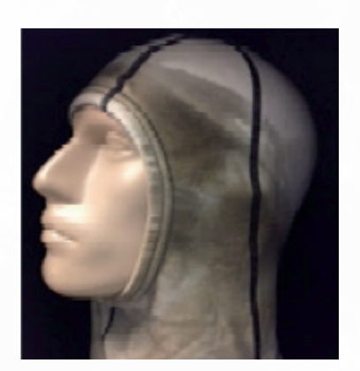
Outside of hood

Compare the amount of particles penetrating the hood with or without the paper-thin DuPont™ Nomex® Nano Flex protective layer.